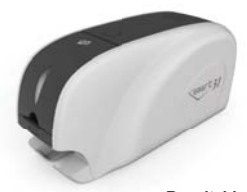
Rewritable ID CARD PRINTER smart-31 R