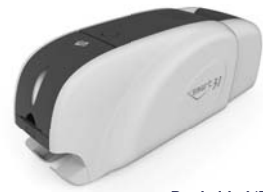
Dual sided ID CARD PRINTER smart-31 D