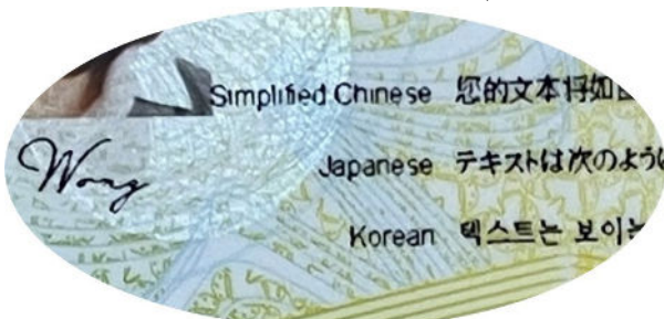
300 x 300 dpi printing Common market print resolution