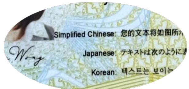
Industry-leading Sigma DS3 printer with 600 dpi high-fidelity print resolution