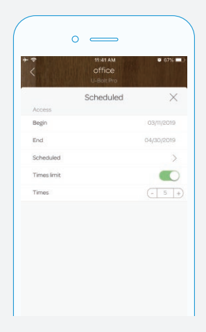
Share Ekey & Code Grant access for specific dates or times.