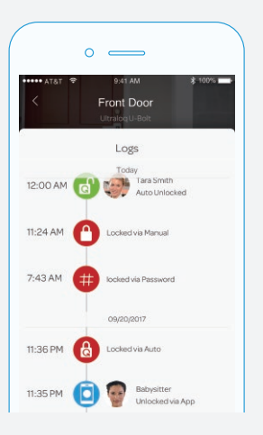
Log Record You can see a Log of who's entered and exactly when they did from your smartphone.