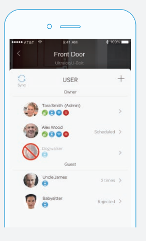
Manage Users Knows who has the access to your lock and how. Add or delete users.