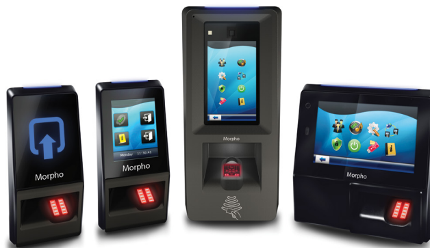
THE SIGMA FAMILY