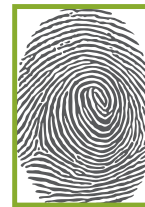
MSO 1300 Series capture