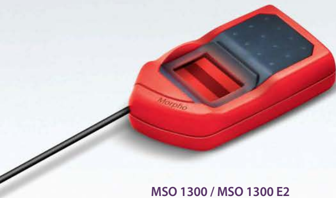
MSO 1300 / MSO 1300 E2

The MorphoSmart™ 1300 Series offers a reliable, ergonomic and cost-effective solution for enrollment, identity verification and user identification. Their match-on-device or match-on-card functions guarantee the faultless protection of information and the security of desktop applications.