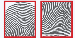
Placement variations on smaller sensors

MSO 1300 Series capture surface (14x22mm) ensures that the richest area on fingerprints is systematically captured time after time. Acquisition surface area contributes significantly to the overall biometric performance: